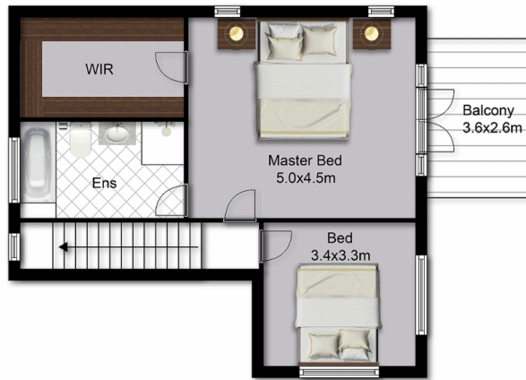
MAIN RESIDENCE FIRST FLOOR